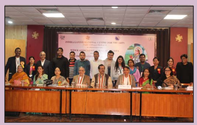
VIPs with Volunteers

conference, members of WAVES, and especially to the authorities of IGNCA for their support to this big academic event. The conference concluded with the recitation of Shanti Mantra .