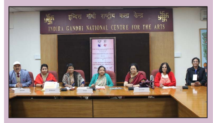
Session in Conference room

conference, members of WAVES, and especially to the authorities of IGNCA for their support to this big academic event. The conference concluded with the recitation of Shanti Mantra .