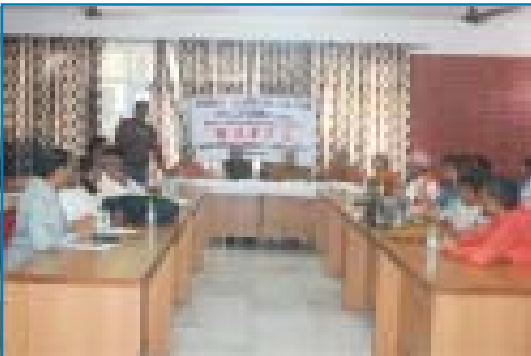
WAVES Function at Gita Bhawan, DU

वैश्विकस्तरे भारतीयज्ञानसम्पदायाः महत्त्वं प्रस्थापयितुं बृहत्तर—वैदिक—अध्ययन—परिषदा (वेक्स) वर्षेऽस्मिन् समायोजितायां परिचर्चाश्रृंखलायां प्रथमा वेदविषयिकी परिचर्चा सत्यवतीमहाविद्यालये अभवत्, द्वितीयाश्च अत्यन्तसमसामयिकी परिचर्चा मार्चमासस्य सप्तविंशतितमे दिनांके