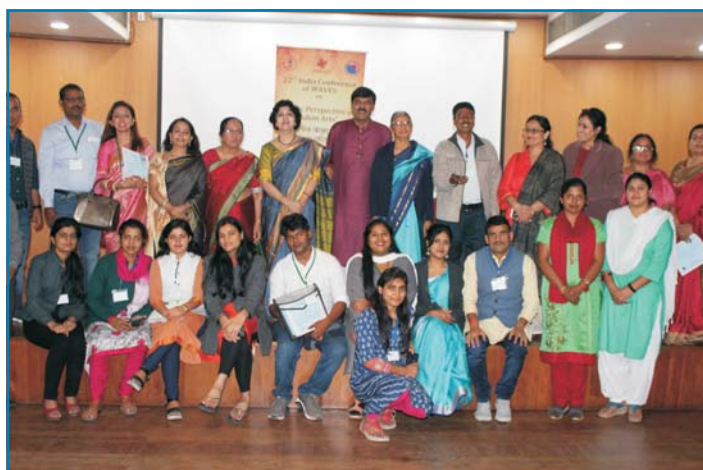
Prize-winners with Judges