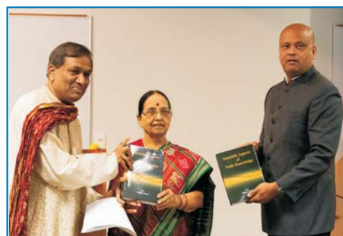
Releasing the proceedings of WAVES 2018