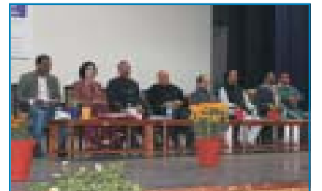
Panelists and Speakers