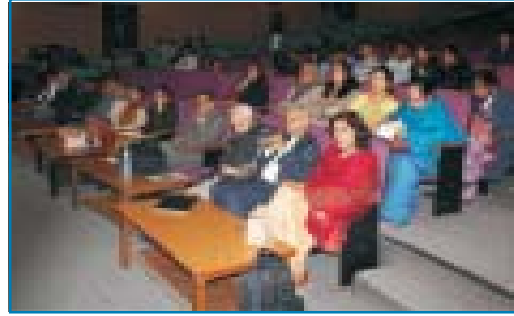
Faculty Members and Participants

He read few recitations from Srimad-bhagwad-gītā and compared those to Bible. Describing Karma as Sādhana , Spirituality and life, he talked about three-