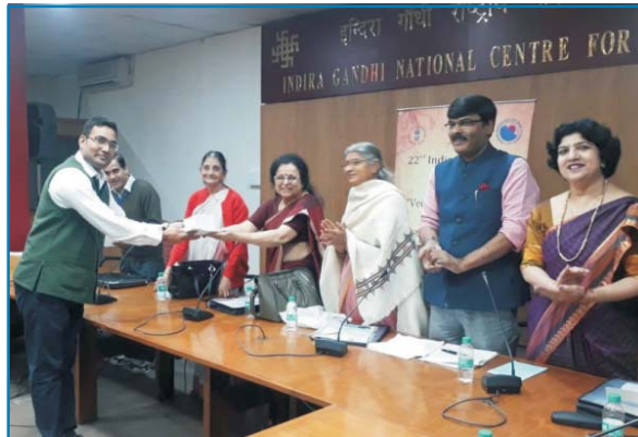
Distribution of certificates

Sri Sri University, Cuttack; M.L.N. College, Radaur; DAV College, Faridabad; Uttarakhand Sanskrit University, Uttarakhand; Shri Lal Bahadur Rashtriya Sanskrit Vidyapeeth, Delhi; Rashtriya Sanskrit Sansthan, Delhi; Allahabad University, Allahabad; Sree Sankaracharya University of Sanskrit, Kerala; Institute of Advanced