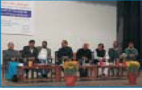
Speakers and Chairman

aspect of Vedānta philo-sophy. By practicing Bhūdhī (intellect), Satya (truth), Anuśāsana (discipline) and Anāsakti (detachment) in daily life one can practically apply Vedānta philo-