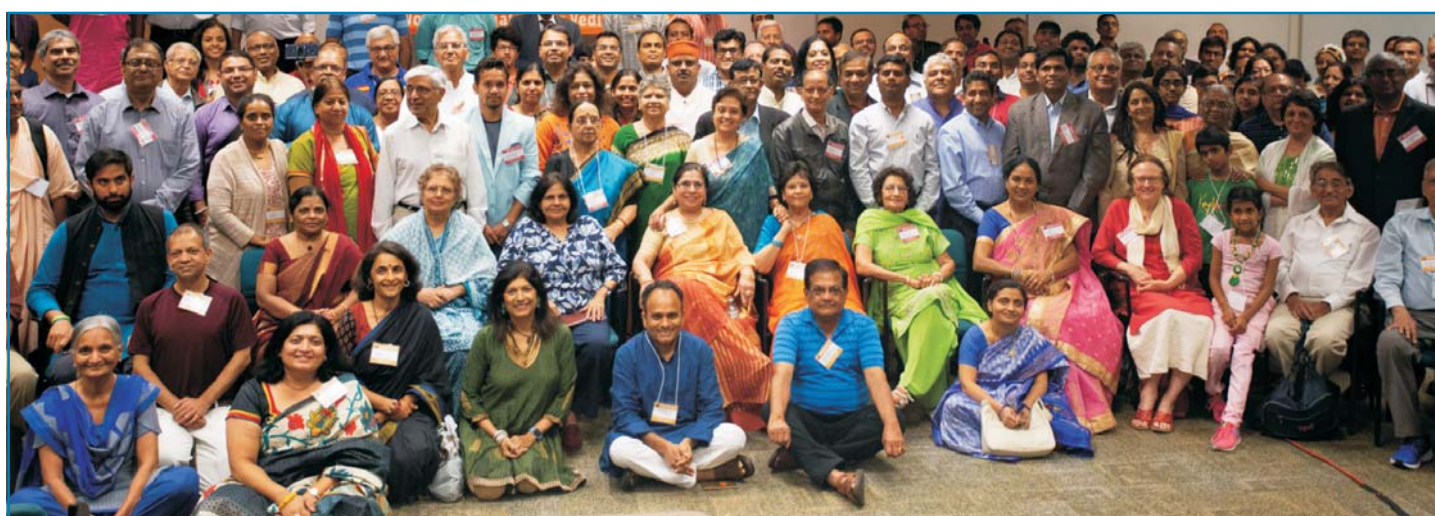
Delegates of WAVES 2018