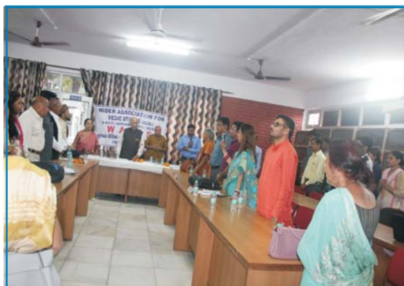
Invocation by Participants on 27-03-2019