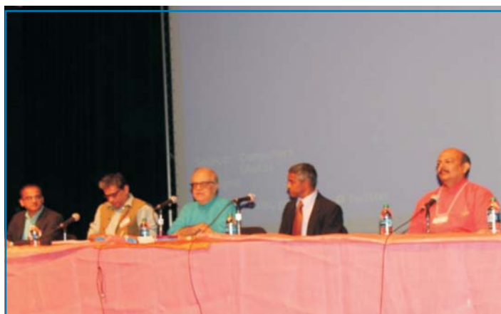
Shri Rajiv Malhotra, President, Infinity Foundation, with other Panelists discussing textbook issue

evidence that the entire framework of such concepts as Proto Indo European (PIE) and Avesta cannot withstand objective scientific and logical scrutiny.