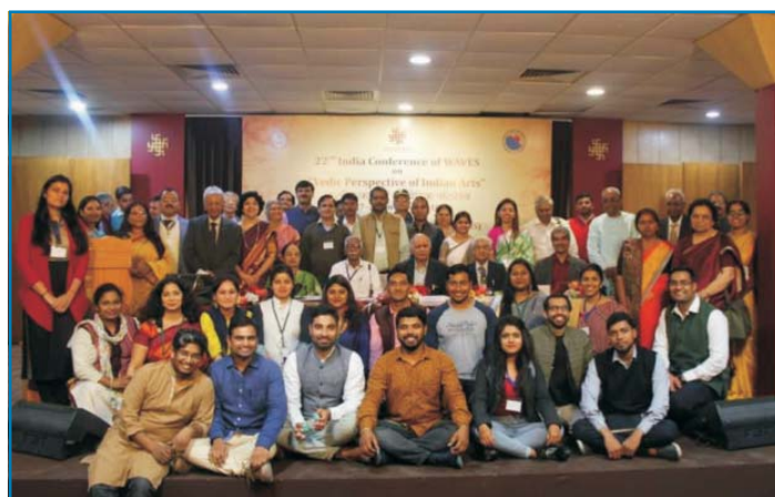
Group of Delegates