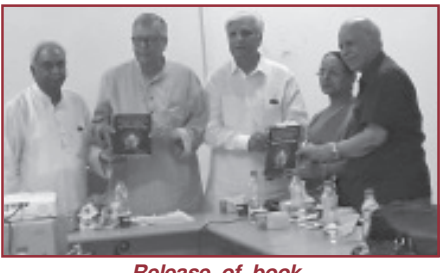
Release of book

Many people made supportive comments about the inclusive nature of research techniques today, which include objective and subjective ones. A