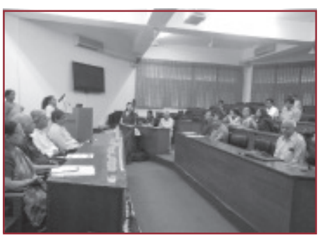
Invocation by Students

explained the glory Sanskrit reference to Sāhitya through PPT. Literature of Sanskrit is very beautiful, attractive, wide and colorful. Its poetry is perfect is all aspects. Very amazing video clips were shown by