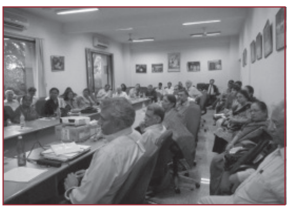
Audience on 8th Oct., 2016 WAVES Program at Delhi