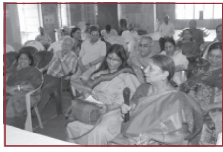
Members & Scholars

in the Vedic verses. A Rgvedic verse praises him for the treatment of sickness of heart ( Hridrogam ) and the yellowness 'Jaundice' of body ( Harimāṇam ). Sungod, is invoked with a group of solar