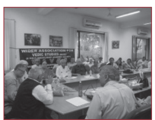
Speakers and audience

with their mere presence, without using any words or even raising a finger. Mokṣa is achieved by (a) a deep desire for it, and (b) the right way to transcend the relative world of mind and body. Vedic