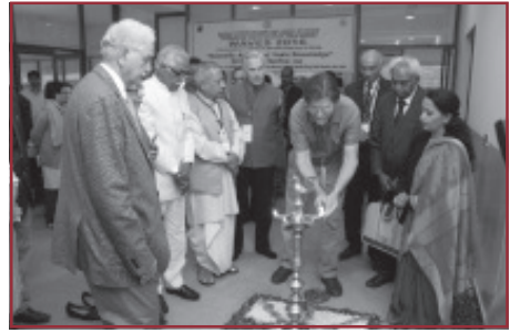
Inauguration of WAVES 2016

Vedic Knowledge' was jointly organized by the World Association for Vedic Studies (USA), Wider Association for Vedic Studies (India) and Bharatiya Vidya Bhavan, Delhi Kendra. This was 12th International and 20th India conference of WAVES which was held from 15th to 18th December, 2016 at Munshi Memorial Hall, Bharatiya Vidya Bhavan, New Delhi. The inaugural session started in the afternoon of first