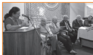
Scholars on stage