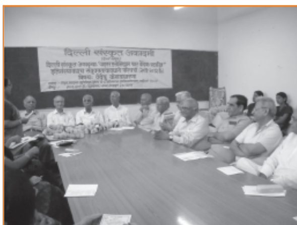
Scholars attending the lecture

seers, the concept of Yoga in the Vedas is formulated. It is certain that there is no aspect of Yogic practice which is not indicated in the Vedas directly or indirectly.