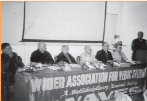
Dignitaries on Dais on 02-01-2012

Please forward your suggestions, comments to :