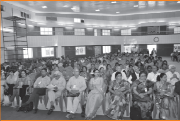
Section of Audience at Haridwar Conference

Cultural Evenings were memorable and relaxing for all after long and serious deliberations during sessions. Enthusiasm among young scholars was praiseworthy.