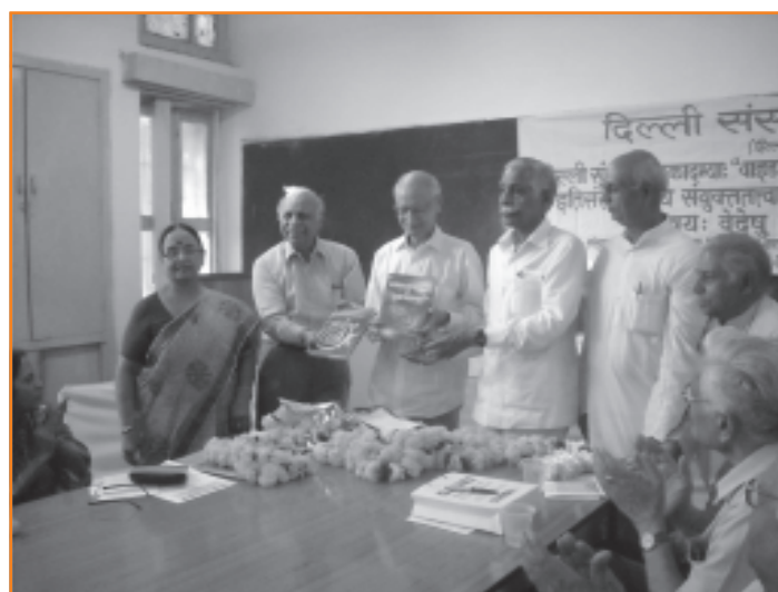
WAVES Books Vols.III & IV released