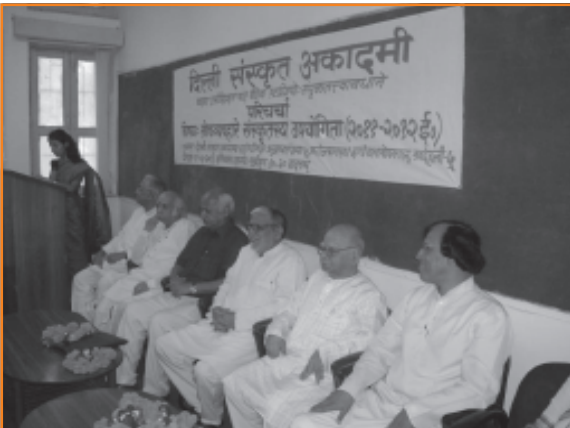
Invited scholars on the dais