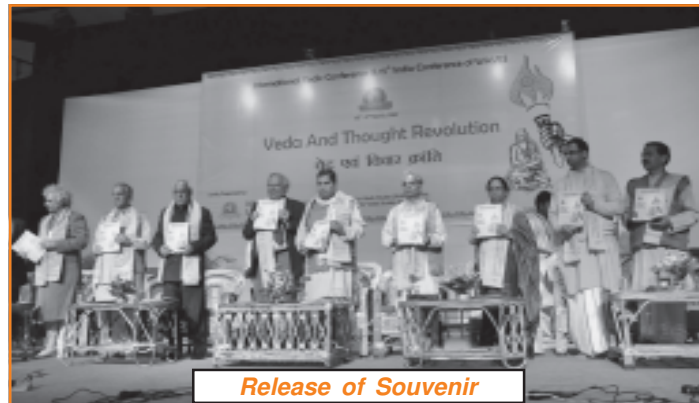
Release of Souvenir

About three hundred delegates from different parts of India and abroad gathered at the pious city Haridwar, Uttarakhand to participate in the conference which was superbly divided into forty sessions under seventeen subthemes mainly related to social, economical, ethical, political, psychological,