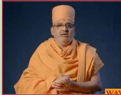
Honourable Mahamahopadhyaya Bhadreshdas Swami ji

online format. More than 152 Scholars from India and abroad had applied for the conference. Out of those 110 academic papers were presented by scholars from various disciplines in 21 sessions. The papers were delivered in Sanskrit, Hindi, and English languages.